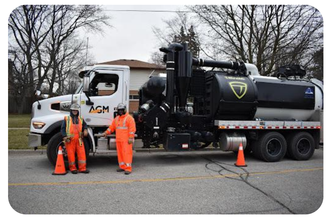
Certified Social Enterprise: A-GM

Buy Social Leader Chandos Construction uses our social enterprise certification to identify social enterprise suppliers for construction projects across Canada, including day labour and catering services.