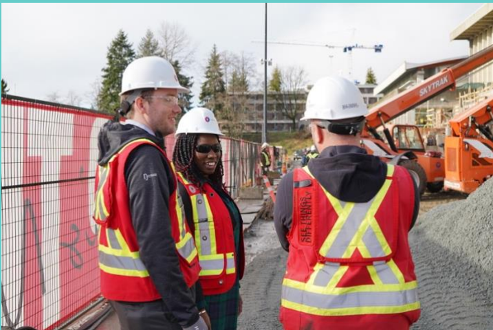
Chandos Construction workers on a site

Chandos Construction is a Canadian construction company that was launched in 1980 with an aim to use construction to make a positive impact in the world. Chandos is 100% employee owned and is one of the first and largest B-Corp Certified commercial builders in North America. Over the last decade, Chandos has been instrumental in building the growing demand for social procurement within the construction sector. They have demonstrated this by embedding social procurement and social value outcomes into their supply chain for public as well as privately funded projects, which is why, by 2025, Chandos has made a Buy Social Pledge that at least 5 percent of their addressable spend will shift to social impact businesses including