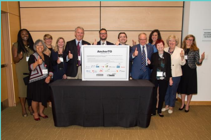
AnchorTO partners working together to support social procurement

AnchorTO was launched in 2014 in an effort to lead and coordinate anchor institutions across Toronto to carry out community-based purchasing and hiring through social value suppliers and diverse-owned businesses. With its multi-billion dollar budget, the City of Toronto is a critical anchor in the social and economic growth of the City. The aim of AnchorTO is to leverage the institutions' annual spending of billions of dollars of goods and services each year, alongside the purchasing carried out by other anchor institutions. 5