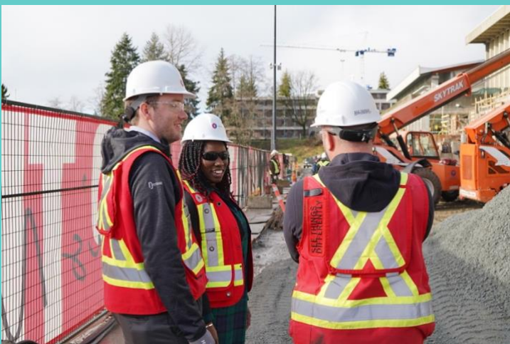
Chandos Construction workers on a site

Chandos Construction is a Canadian construction company that was launched in 1980 with an aim to use construction to make a positive impact in the world. Chandos is 100% employee owned and is one of the first and largest B-Corp Certified commercial builders in North America. Over the last decade, Chandos has been instrumental in building the growing demand for social procurement within the construction sector. They have demonstrated this by embedding social procurement and social value outcomes into their supply chain for public as well as privately funded projects, which is why, by 2025, Chandos has made a Buy Social Pledge that at least 5 percent of their addressable spend will shift to social impact businesses including