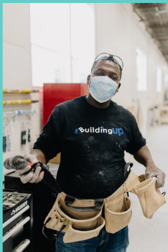
A Building Up trainee hard at work