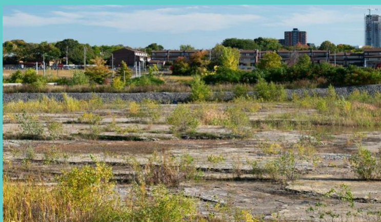
Empty fields inside LeBreton Flats

The Ottawa Community Benefits Network (OCBN) is a grassroots network formed in June 2019 to advocate for the redevelopment of the 56-acre LeBreton Flats property as a vibrant, inclusive, equitable, healthy, and sustainable urban community and to use a Community Benefits Agreement as the platform to ensure meaningful community involvement and accountability. 18 Initially known as the LeBreton Flats Community Benefits Coalition, the rebrand to the OCBN signifies an expanded mandate to realize CBAs for all major Ottawa developments, public and private, and to eventually have the City introduce a CBA Policy for Ottawa. The OCBN now has 32 members, including organizations with mandates in affordable